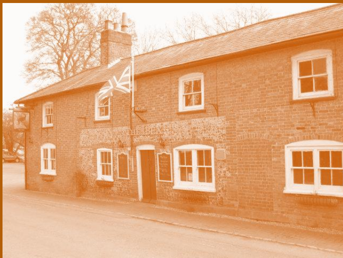
The Ibex Inn